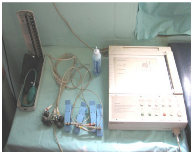
Fig. 1: Electrocardiograph;