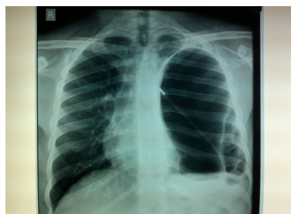
Fig 1: Chest radiography revealing absent lung marking on left side, right sided mediastinal shift, nasogastric tube coiling back to left hemithorax, and blunting of left dome of diaphragm.